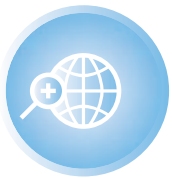
MOTOTRBO Location Services