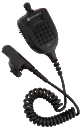
GPS Remote Speaker Microphone