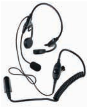
Temple Transducer Headset

The XTS 5000 digital portable radio should offer years of trouble-free performance; however, sometimes unexpected things can happen. Your radios are covered with a standard one-year limited factory warranty. After the initial warranty, Motorola offers a variety of services to meet your repair needs; including Express Service Plus, Service Contracts and Flat Rate Repairs. With over 800 Motorola Authorized Service Repair facilities across the United States in addition to our repair depots, you can rest assured that your radio is restored and returned in peak performance.