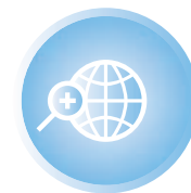
MOTOTRBO Location Services